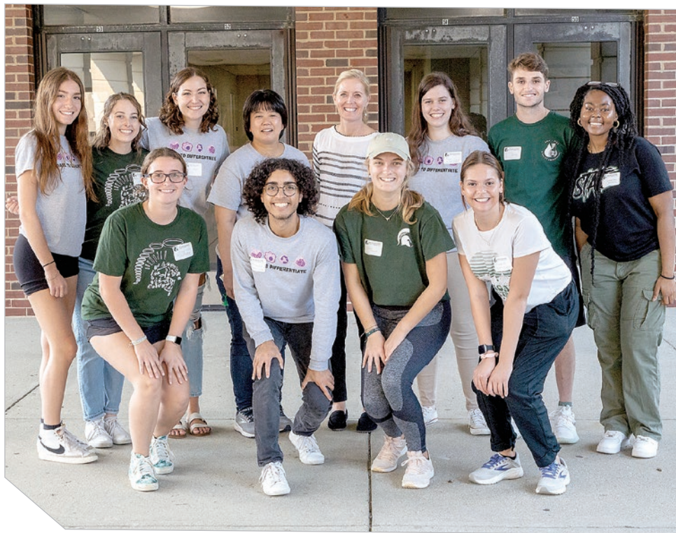
Current BLDSA officers and members posing outside of MSU's Kedzie Hall.

I am excited to see what the future holds for BLDSA, and grateful to be a resource for all BLD students. I would like to thank all those who have contributed to the success of this student association.