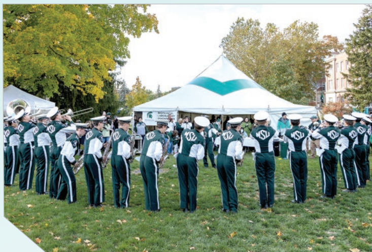
Spartan Marching Band serenading tailgate participants at the MSU vs. Wisconsin football game last fall.

For information about the BLD 2023 tailgate, go to https://msuspartans.com/sports/football/schedule/2023 . We hope to see you there!