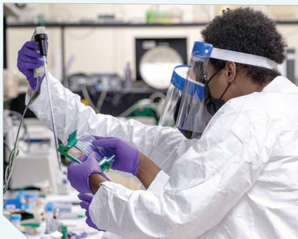
Students in summer graduate lab prepping polyacrylamide gel electrophoresis (PAGE) gels in BLD 832, Molecular Pathology Laboratory.

A: Morris: Laboratory science technology and practices change as medical research discovers new diagnostic markers and methods. The regulatory and billing environments also change regularly. This evolution in our field requires us to be lifelong learners. The certificate programs we offer provide up-to-date knowledge in six credit hours. The six credit hours can also transfer into a master's program if a student decides to pursue a degree.