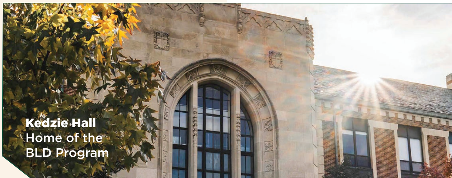
Kedzie Hall Home of the BLD Program