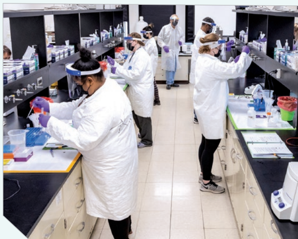
Graduate students working on DNA isolation in BLD 852, Immunodiagnostics Laboratory.